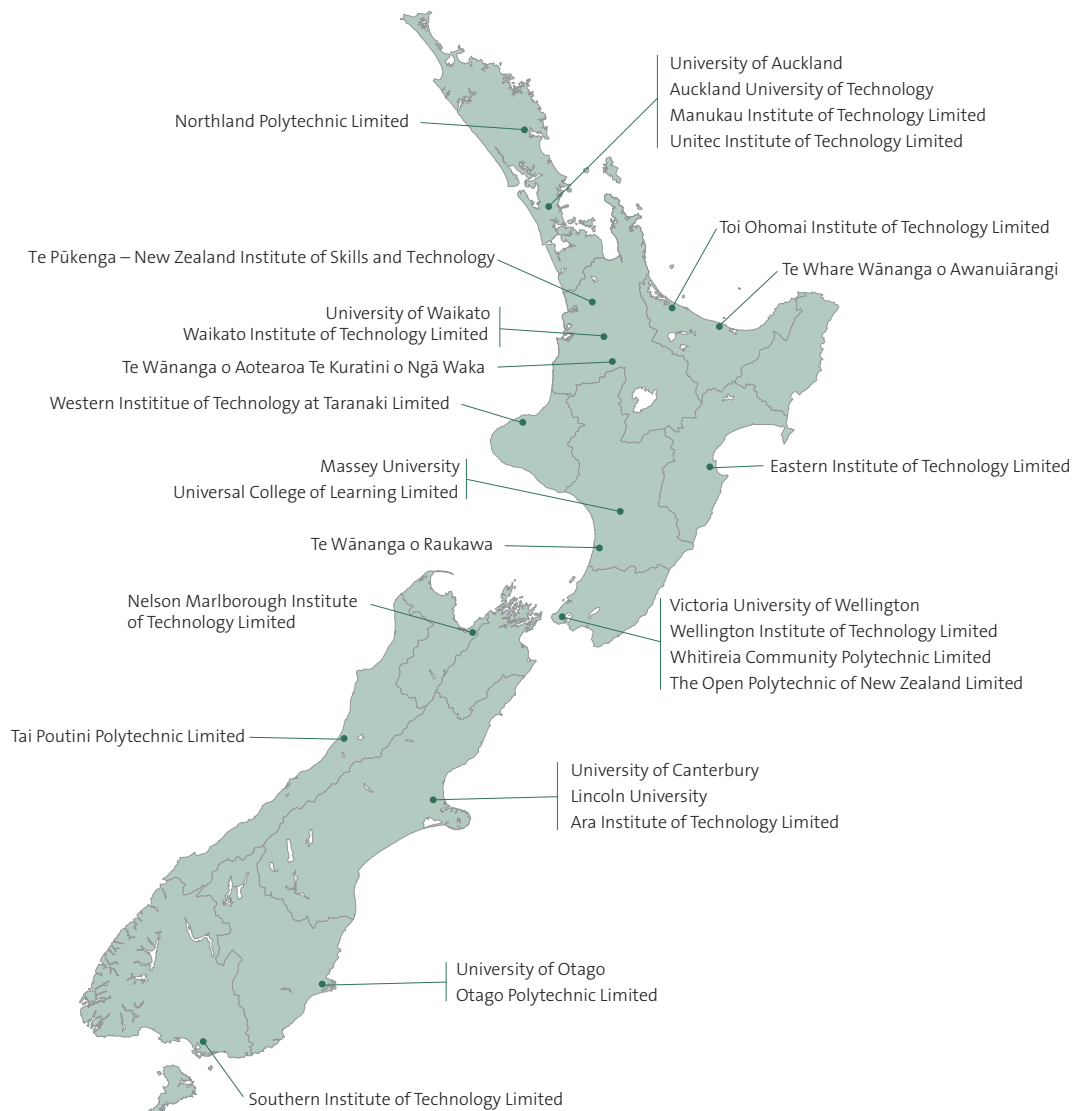
Figure 1 Main campus or headquarters of the tertiary education institutions in New Zealand