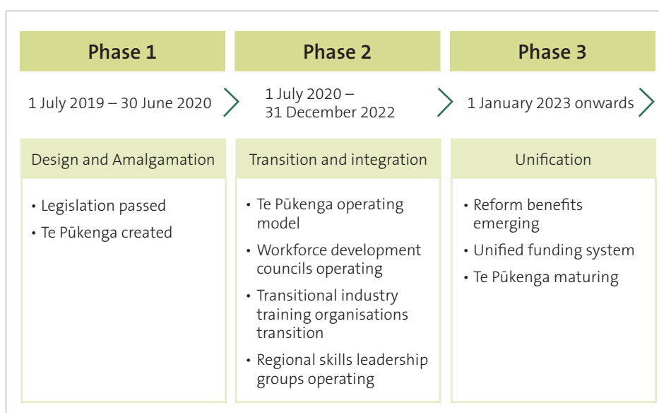
Figure 5 Three phases of the vocational education reform programme