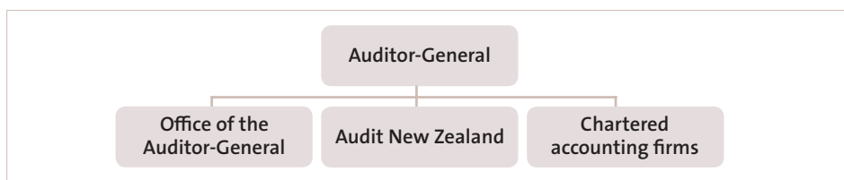
Figure 1 The organisational arrangements of the Auditor-General

Figure 1 shows the relationship between the Auditor-General, the OAG, Audit New Zealand, and private sector accounting firms.